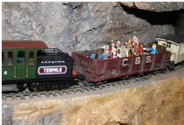
'Hanging rock' "SNAPPY" gets the SHOTS

The Great Train Chase continues. After shoppin' fer a new loco in Denver's Caboose Hobbies where Toyman showed our Madam Lash a wide variety of new & used injuns, they knowed the Outlaws gang was hid-out up the narrow valleys of Central City & Blackhawk so a big 'K' injun was too heavy fer them tracks & they git a Mason Bogie #6, the lovely "Tenmile". Its whorefool dry them ways so they filled up with plenty o' DW's to take 'long. Sparky heard from the Forks Creek radio that the Outlaw was seen there robbin' local gold mines of them's ore. The Sheriff got himself a new multi-Six-Gun fer any shoot-outs with dem desperado's.