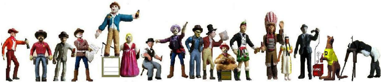
SILVERTON "LITTLE FOLK" IN THE GREAT TRAIN CHASE AROUND THE WORLD - HON3

The original "Little Folk" involved in "THE GREAT TRAIN CHASE" - world first Hon3 extravaganza.